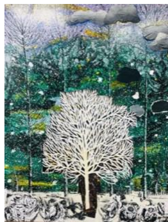
'The presence of Ancient Thunder', 2009-2010